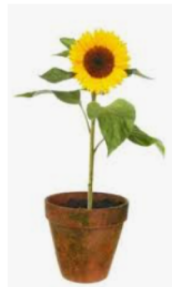
My Diary of a Sunflower Plant

Challenge: Take a measurement of your plant using a ruler!